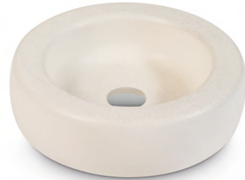
Photography of the Piece